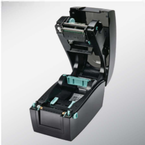
Modern clam-shell design makes it simple to load labels

The small footprint RT200 is a perfect printer solution where space is tight and value pricing is important