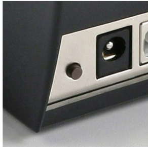
Innovative "C" button makes label Calibration simple and fast