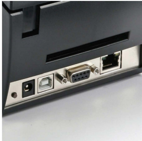
Ethernet, Serial and USB are standard features adding flexibility and power