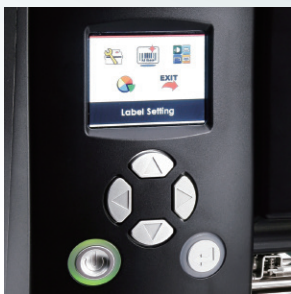
Color TFT LCD and operation panel for easy and intuitive operation

All metal mechanism design featuring die-cast center plane and base make EZ2250i series perfect for high volume applications