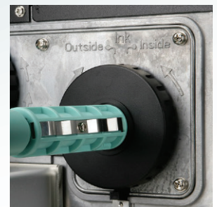
Automatic self adjustment for coated inside/outside ribbons