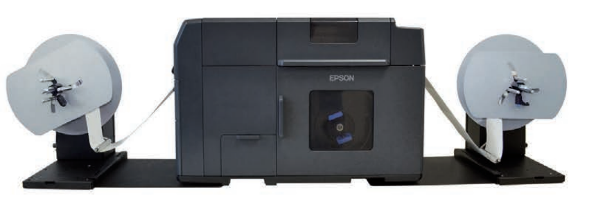
LABEL REWINDER (ASDIIII-SD) - Epson C7500 printer - LABEL UNWINDER (ASSIIII-SD) (Not included)

The unwinder and rewinder for Epson C7500 printers are used to manage rolls of media up to 5", while having an outside diameter up to 10" (250mm). Units are equipped with adjustable core holder from 1.57" up to 4.64" (40-118mm).